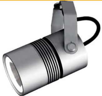
shown with no accessory