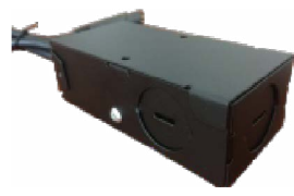
Terminating Junction Box

Technical Specs: 120Vac Multiple 1/2" knockouts Captive mounting screws Up to 300W on single box