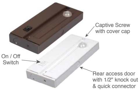
Switch Box with occupancy sensor

Technical Specs: 120Vac Multiple 1/2" knockouts Captive mounting screws Time Delay: 30 sec minimum Dimensions: 8-1/4"L x 1"H x 3-5/8"W Occupancy Timeout: 10 sec Sensing Distance: 3 ft Up to 300W on single box