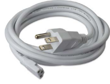
Plug-In Power Feed