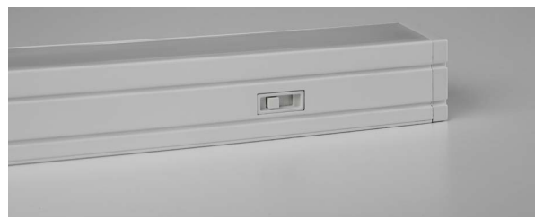
Standard three selectable CCT 3000K, 3500K, 4000K