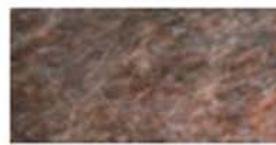
AM - Almond Mica