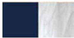
BC - Blue and White Opalescent combination