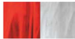
REC - Red and White Opalescent combination

offered in Etoile, Glasgow, Kennebec, Saint Clair, State Street, Yorktown