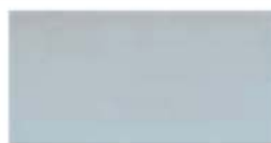
F - Frosted