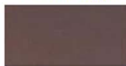
RB - Rustic Brown