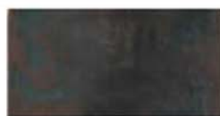
BZ - Bronze