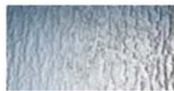
RM - Rain Mist