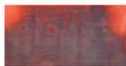
RC - Raw Copper