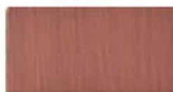
AC - Antique Copper