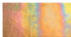
GW - Gold White Iridescent