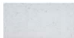
CS - Clear Seedy