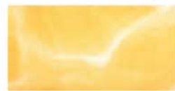
TN - Tan