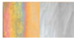
GWC - Gold White Iridescent and White Opalescent combination