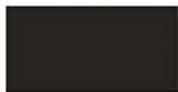
BK - Satin Black