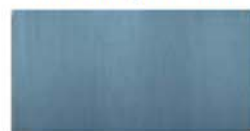
P - Pewter