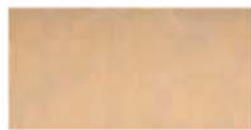
OF - Off White