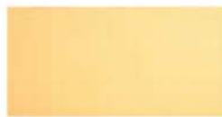
CR - Cream