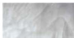
WO - White Opalescent